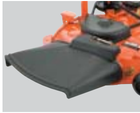
Gate open with discharge chute

In this mode, the deck discharges grass evenly and efficiently through the side of the deck, utilizing two counter-rotating blades. The flow created by these blades is where the Infinity Deck gets its name.