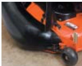
Gate open with grass catcher attached

Using the optional grass catcher is now easier than ever. Due to the powerful flow of the Infinity Deck, a blower is no longer needed—the deck does all the work. With this design, attaching the grass catcher's boot is made simple.